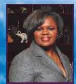
Luncheon Speaker First Lady Sheretta West The Church Without Walls Houston, TX