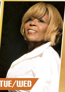
TUE/WED VANESSA BELL ARMSTRONG GUEST PSALMIST